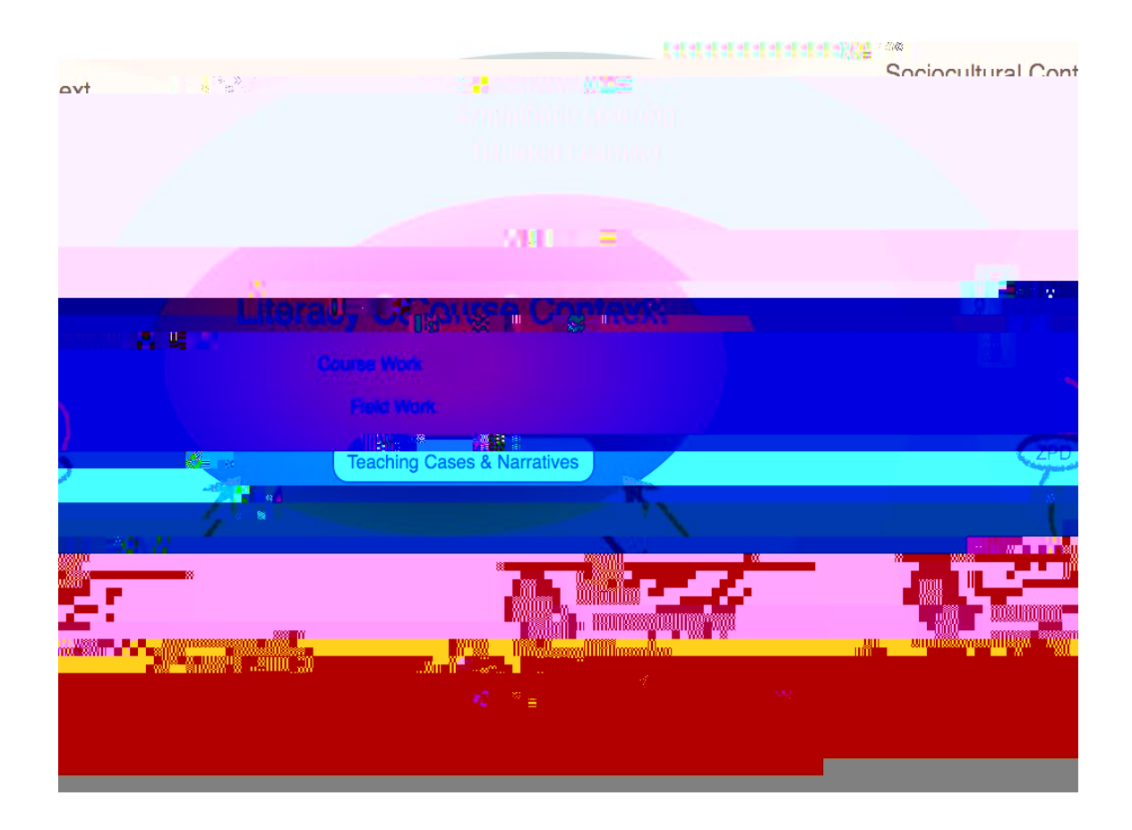
Figure 3 : Theoretical Frame and Findings Influencing the Classroom Context. A model depicting findings and the theoretical frame of this study where teaching cases and postcard narratives where embedded into a literacy course.

These factors (see Figure 3) influenced how the professor and the preservice teachers engaged in the case-based discourse as individuals and as a group while discussing the teaching case. The professor used the cases to discuss specific literacy