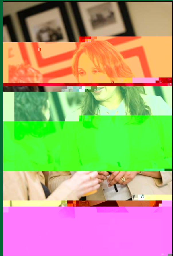
Natasha Trethewey , Poetry Pulitzer prize winner, talking with a student before her lecture at the Alumni Center on April 17th.