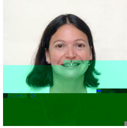
Dr. A e e o D n n

e_w r s or one e r n t e o n t o e p e n n p o n t n r n t s n o e r e n e e o r s e o n e r s p e e s t o n e s r e e e _